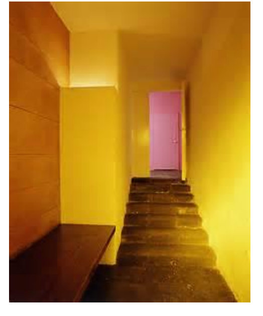
Day Six: Thurs. Aug. 13, Art Gallery Crawl, Jumex Museum, Luis Barragan House (B, L)