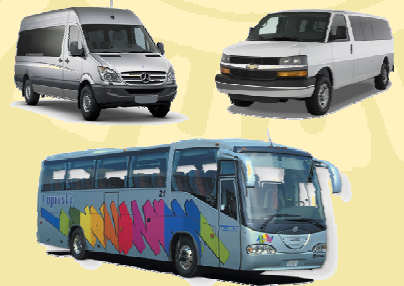
Transportation: Licensed, insured, comfortable and safe vans or coaches