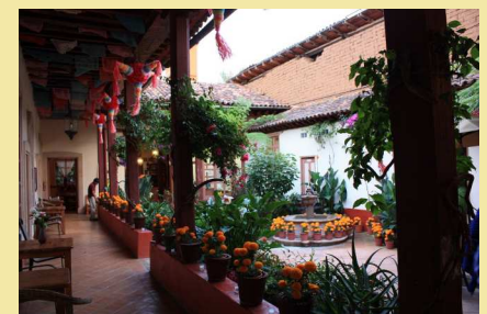
Hotels: Centrally Located and Charming properties in Morelia, Anganguero and Patzcuaro